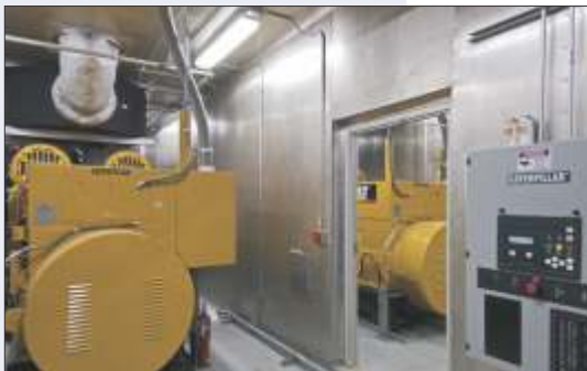
Genzyme CUP Building Dual Roof Mounted Generators