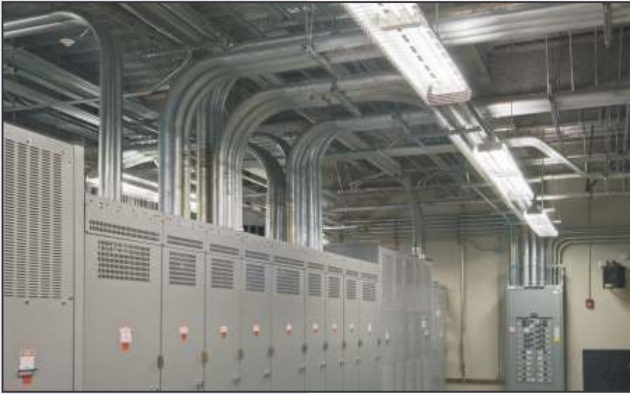
Genzyme CUP Building Redundant components and systems were required for this project to insure continuous operation.