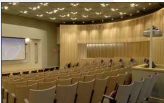
New England BioLabs Lecture Center